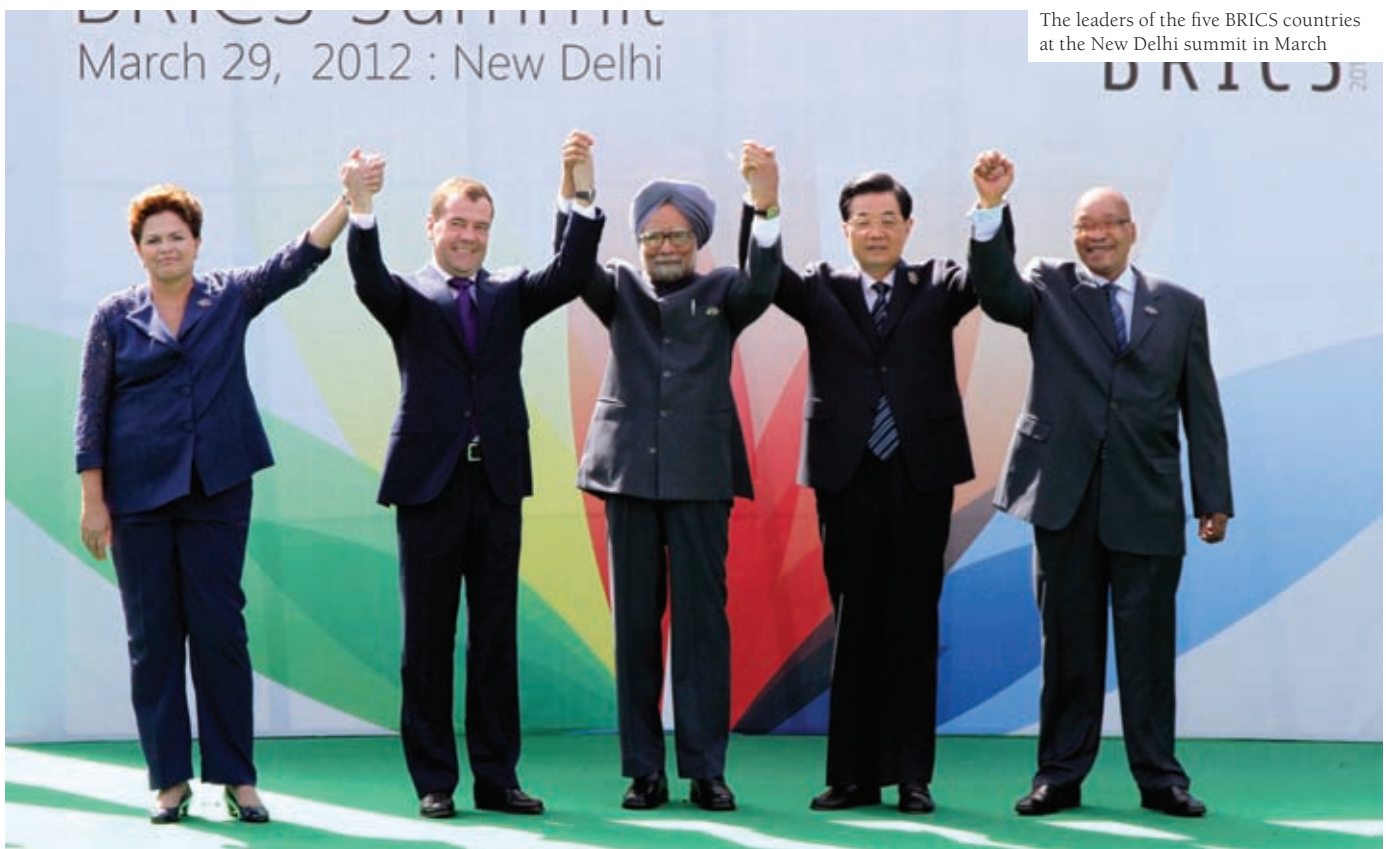
The leaders of the five BRICS countries at the New Delhi summit in March

There are, of course, considerable obstacles and risks attached to any movement along these lines – especially if this movement was to take any bold form, such as an invitation for the BRICS group to take part in some or all of the G8 Camp David process.