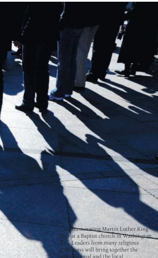
Commemorating Martin Luther King Day at a Baptist church in Washington, DC. Leaders from many religious traditions will bring together the international and the local

at each summit aim to have recognisable continuity in their engagement.