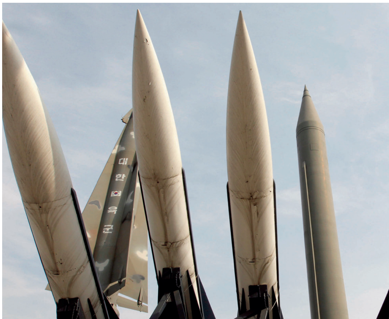
Models of a North Korean Scud-B missile and South Korean Hawk surface-to-air missiles on display at the Korean War Memorial Museum in Seoul

Doing so will increase the impetus for creating a new global governance that more clearly establishes