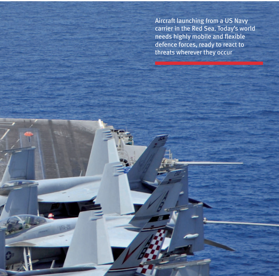
Aircraft launching from a US Navy carrier in the Red Sea. Today's world needs highly mobile and flexible defence forces, ready to react to threats wherever they occur