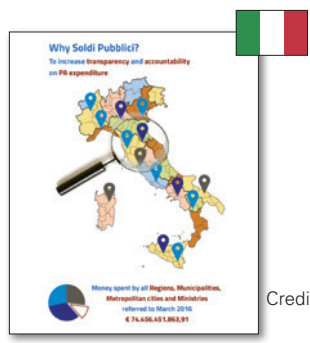
Credit: Agency for Digital Italy, http://soldipubblici.gov.it/it/home/