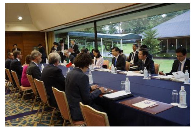
Bilateral meeting with the Honorable Graziano Delrio, Minister of Infrastructure and Transport, Italy

Demonstration of automated driving vehicle/next generation vehicle (the Honoroble Anthony Foxx, U.S. Secretary of Transportation on ride)