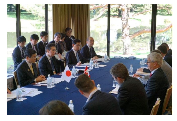
Bilateral meeting with the Honorable Marc Garneau, Minister of Transport, Canada