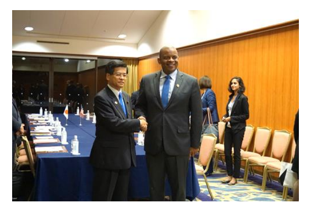
Bilateral meeting with the Honoroble Anthony Foxx, U.S. Secretary of Transportation