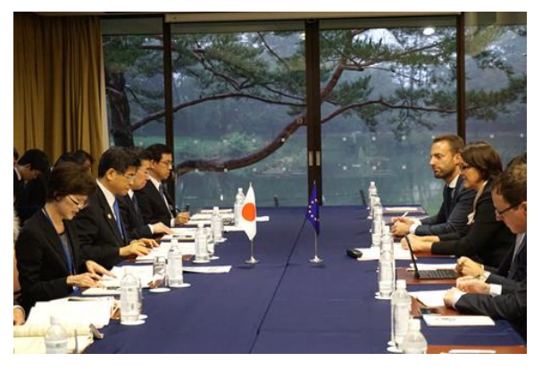
Bilateral meeting with The Hoborable Violeta Bulc, European Commissioner for Mobility and Transport