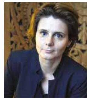
Caroline FOUREST (France) Writer, editor, film director