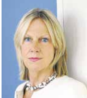
Brigitte GRÉSY (France) President of the High Council for Gender Equality