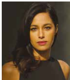
Rula JEBREAL (Italy-Israel-Palestine) Journalist, author, and foreign policy analyst