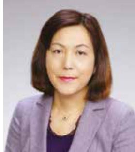
Yoko HAYASHI (Japan) Lawyer and former president of the Committee on the Elimination of Discrimination against Women