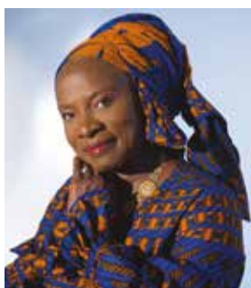
Angélique KIDJO (Benin) Singer, composer, Grammy Awards winner and UNICEF Goodwill Ambassador